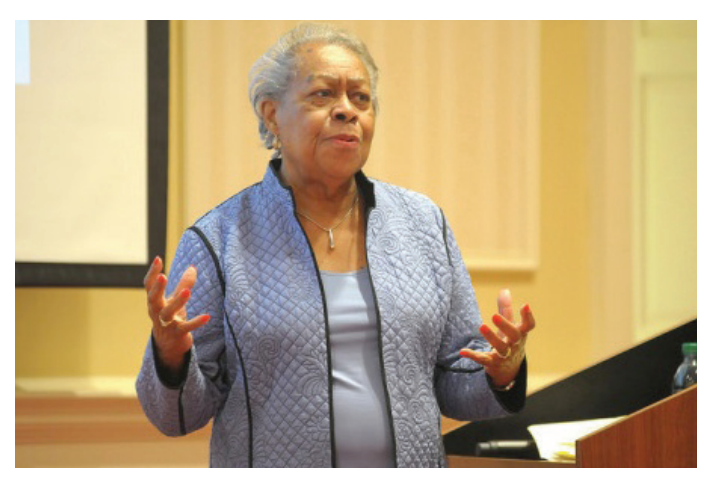
Senator Delores Kelley addresses the Maryland Commission for Women

data culled from the U.S. Census and information compiled by the Institute for Women's Policy Research reflecting some of the key issues confronting women in this state.